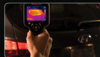
Find breaks in rear window defoggers

DETECTS PROBLEMS ALL AROUND VEHICLE: BRAKES, HEATED SEATS, MISFIRES, HVAC, WORN BEARINGS, BELTS, EMISSION CONTROLS AND MORE