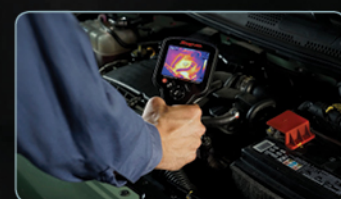
See problems in fuses and relays