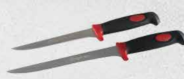
Snap-on Fishing Knives

Buy selected tools to get one of the above items FREE - Ask your franchisee for more information