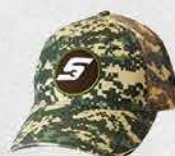
Digital Camo Cap