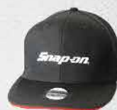
Snap-on Flat Bill Cap