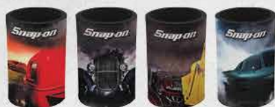
Magnetic Can Coolies