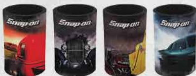
Magnetic Can Coolies