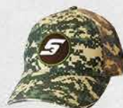
Digital Camo Cap