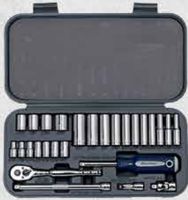
27 Piece 1/4" Drive Metric General Service Set