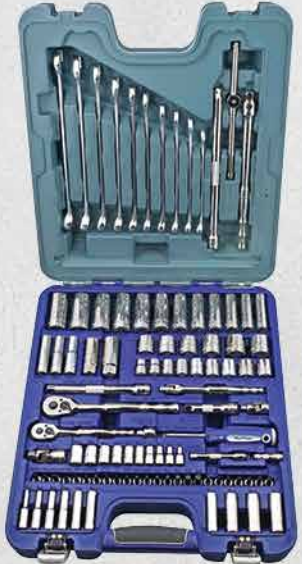
1/4" & 3/8" Drive 100 Piece Metric General Service Set