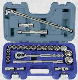
25 Piece 1/2" Drive Metric Socket Wrench Set