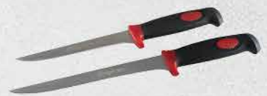
Snap-on Fishing Knives

Buy selected tools to get one of the above items FREE - Ask your franchisee for more information