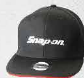
Snap-on Flat Bill Cap