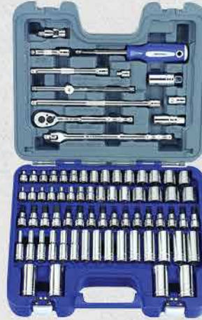
3/8" Drive 77 Piece Metric General Service Set