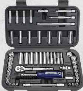
62 Piece 1/4" Drive Imperial and Metric General Service Set